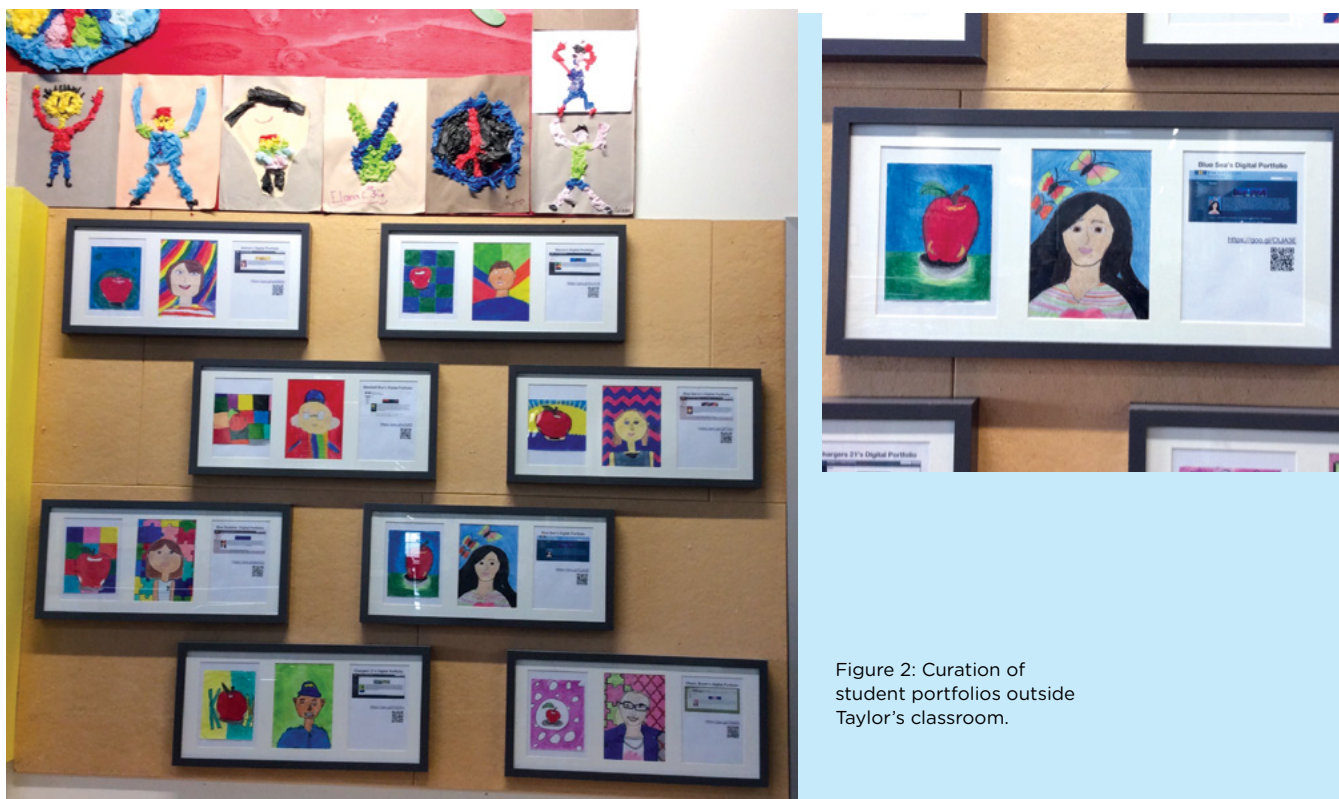
Figure 2: Curation of student portfolios outside Taylor's classroom.

This elementary school teacher considers digital portfolios to be consistent with other HTeCV assessment practices, including narrative-based report cards, student-led conferences, and project exhibitions. All of these practices encourage student reflection and self-directed learning, make peer feedback and review possible, and provide opportunities for sharing schoolwork with an outside audience. The interlacing of student work online (i.e., through digital portfolios) and offline (i.e., through displays of student work in the classroom) ties into the goals of HTeCV to underscore projects as more meaningful than grades alone.