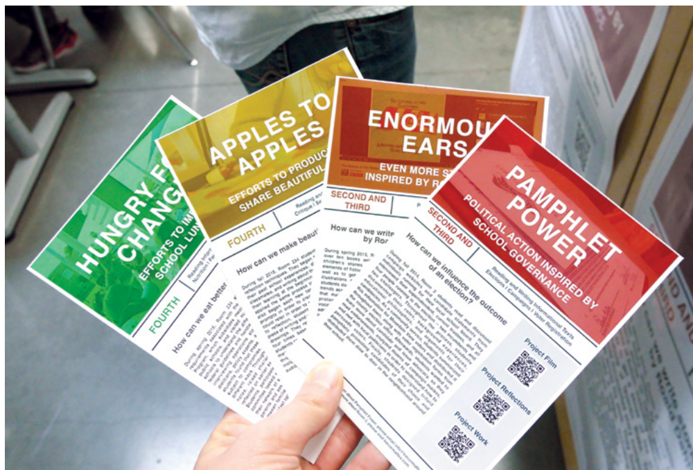
Figure 5: Flyers of whole classroom projects with QR codes that link to project videos.