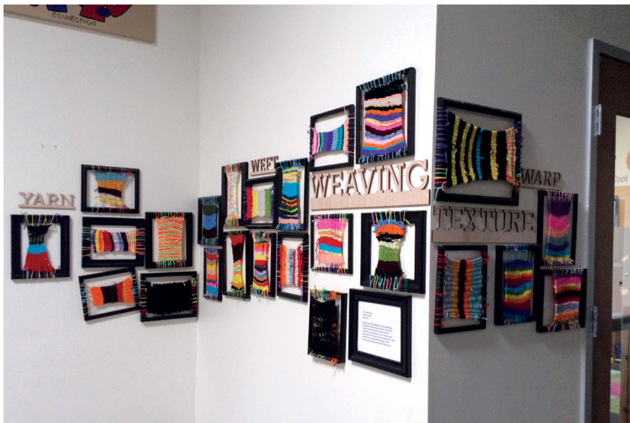
Figure 1: Tapestry art installation at High Tech Elementary Chula Vista.