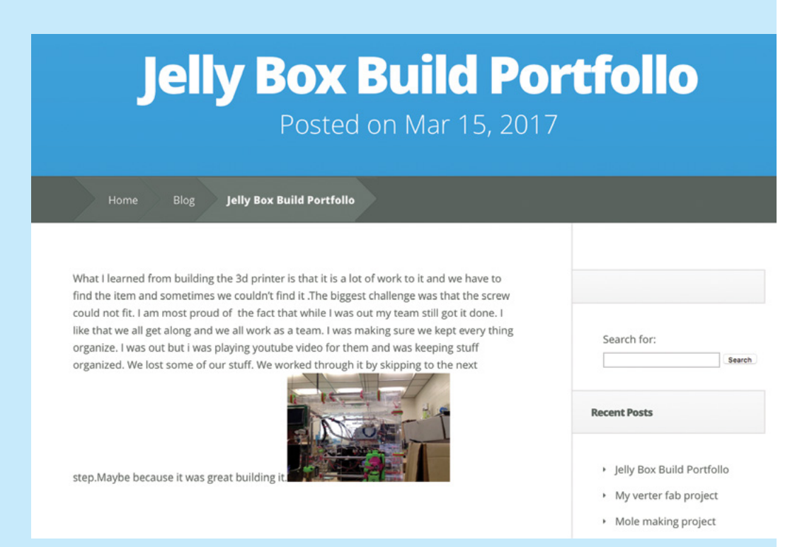
Figure 2: Portfolio of a youth (left) and the youth. digitalharbor.org landing page (right), in September 2016.