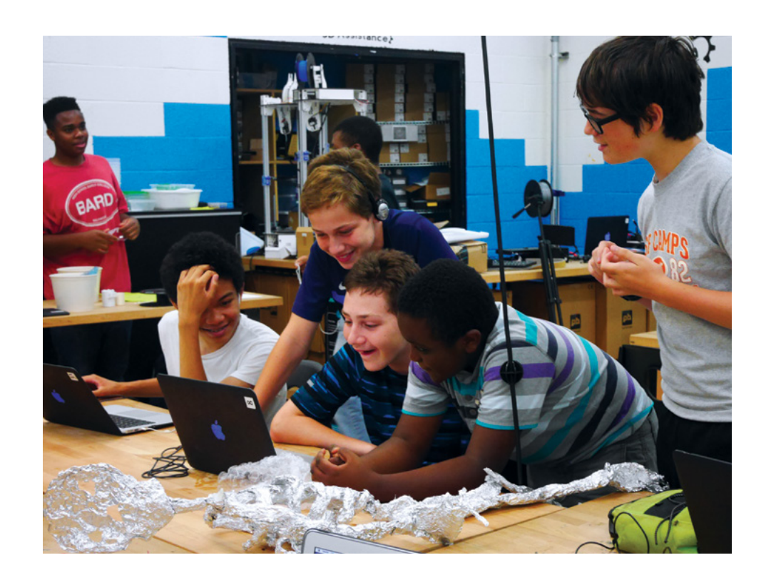
Figure 1: Youth working on their digital filmmaking project during a Maker Foundation program at Digital Harbor Foundation.

DHF began facilitating makerspace-wide digital youth portfolios in early 2014, iteratively refining their process and use of tools to accommodate emergent challenges and youth needs. Moving from Evernote, an online journaling tool for creating and sharing notes, to Tackk (no longer functional), an online platform with drag-and-drop, auto-saving, and social media commenting features, DHF most recently moved to a WordPress-based custom portfolio system. This exploration of available tools across three years made it possible for DHF to pilot a range of tools and practices and to build rich experiences for youth. To capture and draw on these youth experiences, the space implemented a youth steering committee that helped align iterations of the portfolio practices to youth interests and needs.